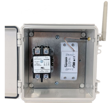
Part #: MEU-2PWF