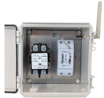
Part #: MEU-2PWF